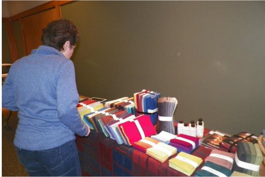
So much beauty to inspire us!